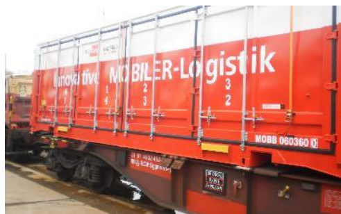
Multitainer 36 – K