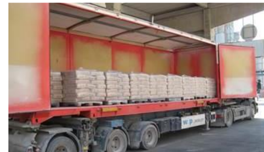
Multitainer 36 – H