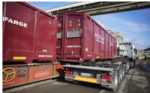
30 ft bulk materials container