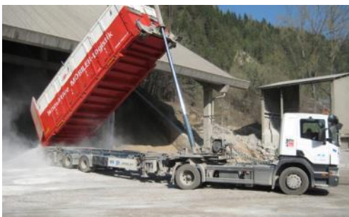
30 ft Multitainer with bulk materials