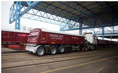
30 ft Halftainer