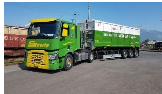
BIO grain container